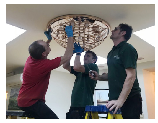
Chandeliers at Bramley House.

Redecoration has also taken place in the main lounge area, middle lounge and orangery and new furniture installed.